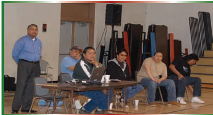
About 95 attended the General Meeting on Sunday, April 27th at the Tribal Gym.