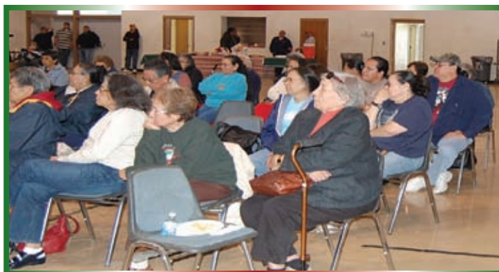
Many people expressed an interest in holding a monthly General meeting so all our issues may be discussed regularly.