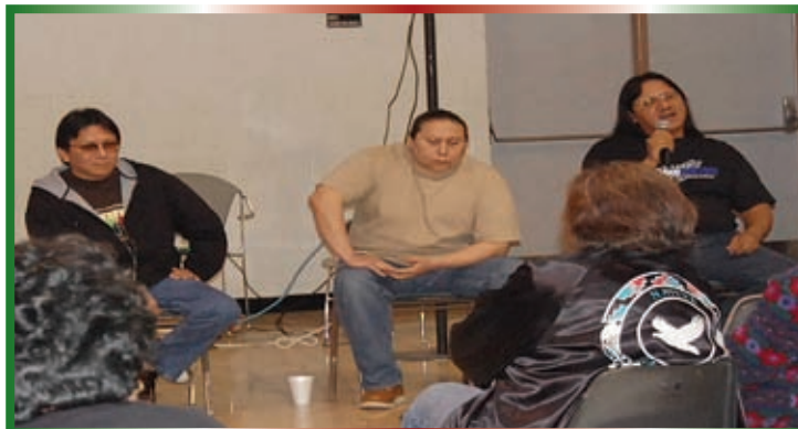
A second meeting was held on April 29th, with a little over 100 people attending.